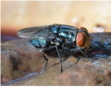
USDA Holds Due to Plant Health Risk