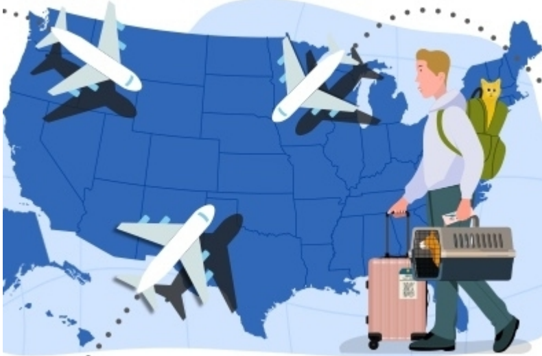
Take a Pet From One U.S. State or Territory to Another (Interstate)