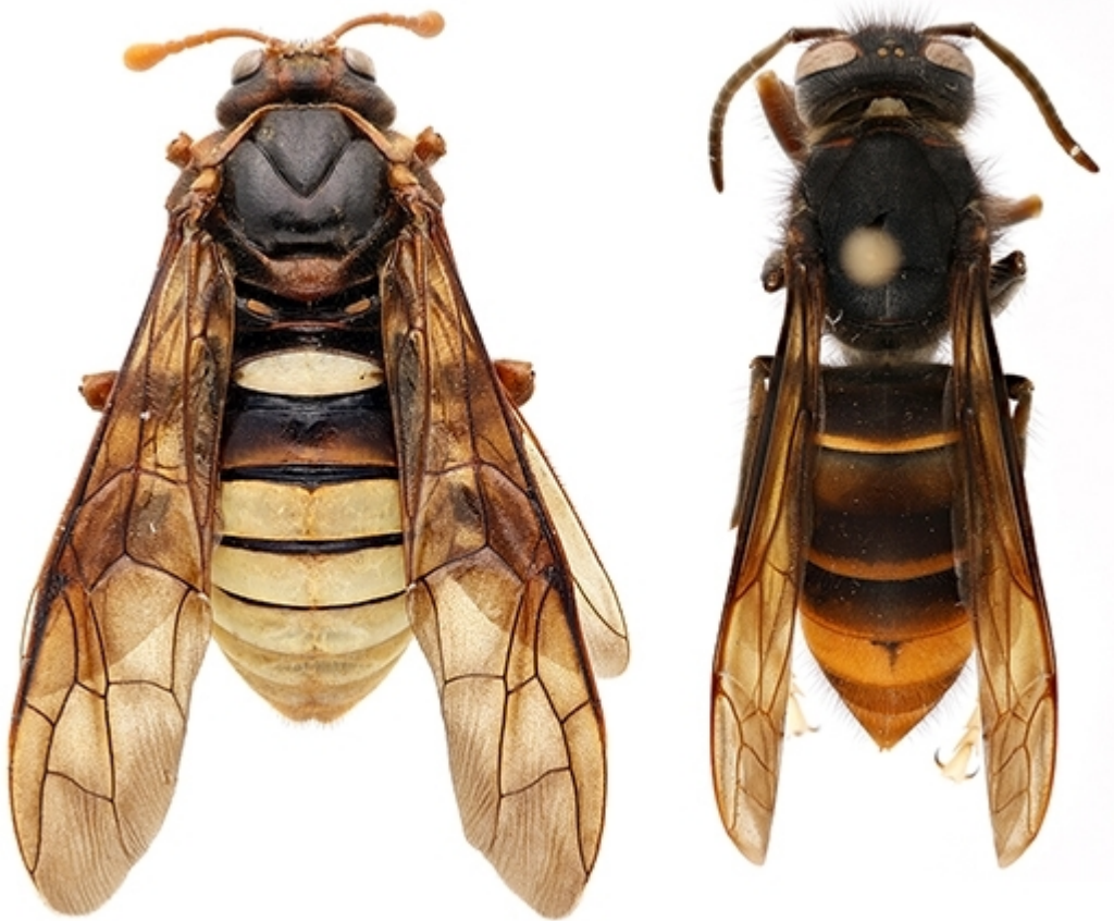
(left) elm sawfly ( Cimbex americana ) | (right) yellow-legged hornet ( Vespa velutina )