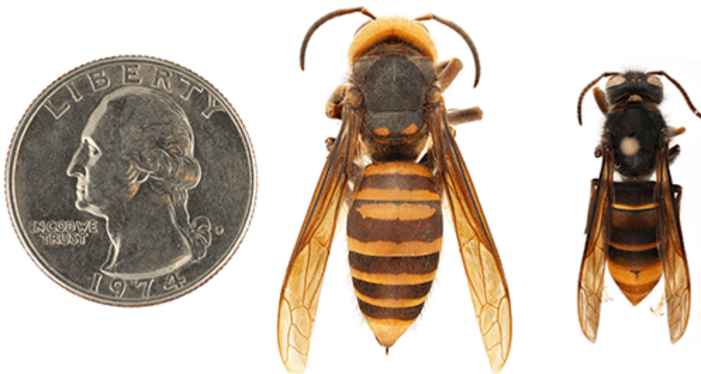
(left) northern giant hornet ( Vespa mandarinia ) | (right) yellow-legged hornet ( Vespa velutina )