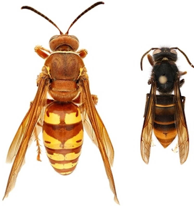
(left) western cicada killer ( Sphecius grandis ) | (right) yellow-legged hornet ( Vespa velutina )