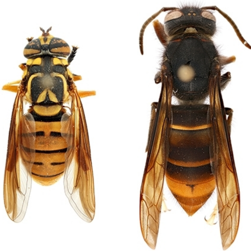
(left) hoverfly ( Spilomyia spp.) | (right) yellow-legged hornet ( Vespa velutina )