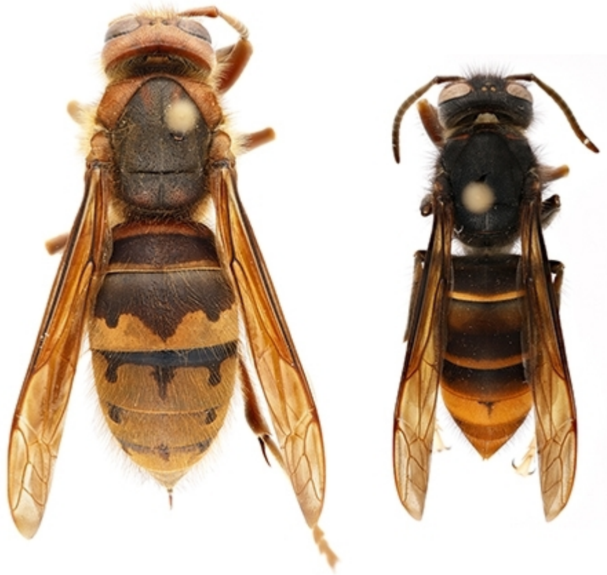
(left) European hornet ( Vespa crabro ) | (right) yellow-legged hornet ( Vespa velutina )