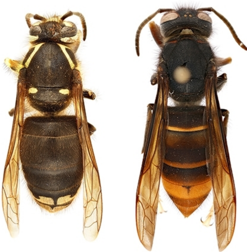
(left) bald-faced hornet ( Dolichovespula maculata ) | (right) yellow-legged hornet ( Vespa velutina )