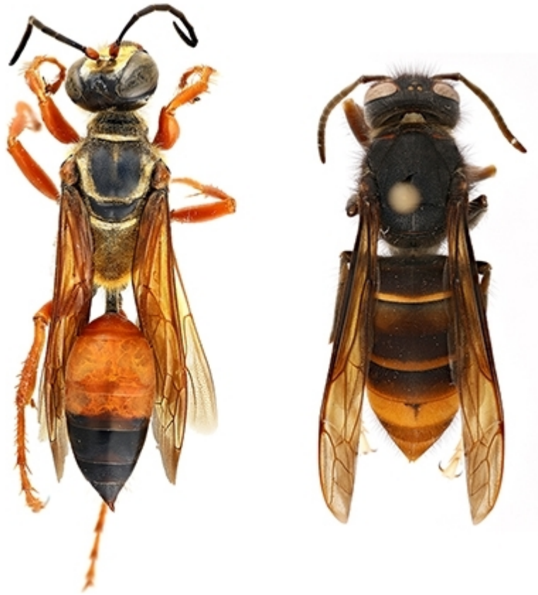
(left) great golden digger wasp ( Sphex ichneumoneus ) | (right) yellow-legged hornet ( Vespa velutina )