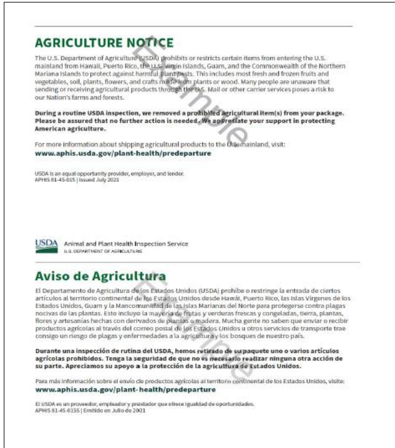
Figure A-9 Example of the Agriculture Notice

Issue an Agriculture Notice when a prohibited agricultural article is found and removed from a package. For ECO packages, place a copy of the Agriculture Notice in the package. For U. S. postal mail packages, place a copy of the completed PPQ Form 287, Mail Interception Notice and the Agriculture Notice in the package.